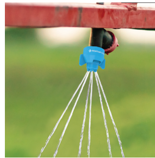
Stream integrity reduces unwanted small droplets that cause unintentional plant damage.