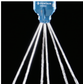
Six stream pattern in a compact design.