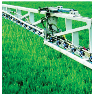
Advanced fertilizer nozzle capable of both pre and post emerge fertilizer applications.